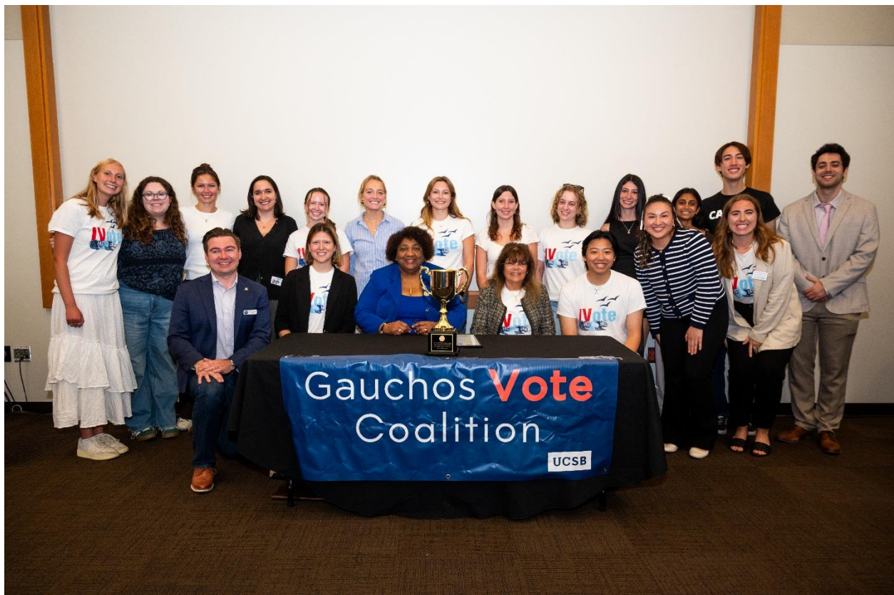
Shirley N. Weber, Ph.D., California Secretary of State presented the Ballot Bowl trophy to UC Santa Barbara staff and students.